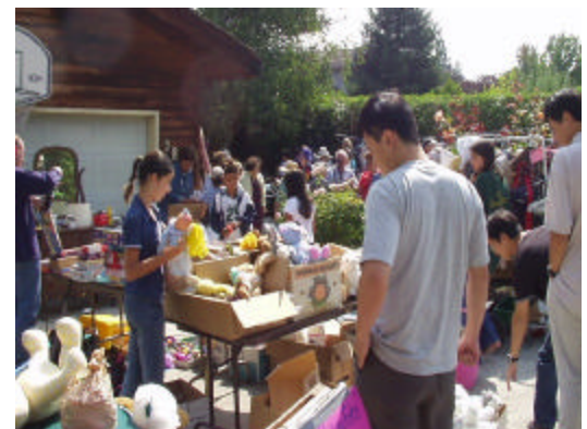
Some of the many visitors at our Benefit Garage Sale!

Our first ever Benefit Concert and Silent Auction in September was a great success as well. We all participated in a special (and occasionally silly) evening of worship with a local band named “Holy Moment” and then ended the evening with our Silent Auction and some wonderful refreshments provided by the lovely ladies at PBC. Again, many volunteers, friends and donors came together to make this evening a success, thank you to all of you who participated!