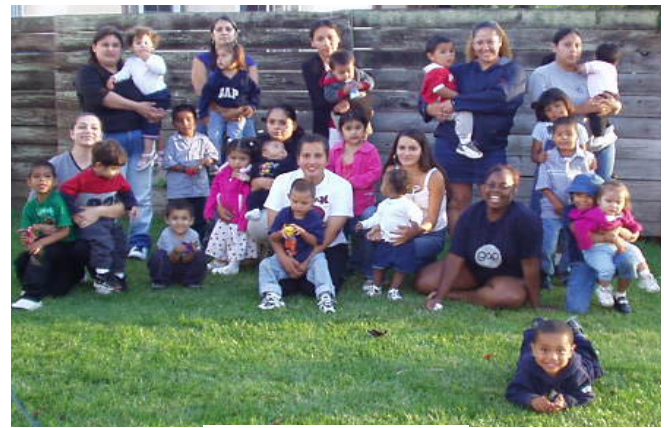
Parenting Class, 2002

I know one thing for sure, I thank God for having NCHM do His work. I remember when I lived at New Creation Home, I started really getting into my Bible. That feeling of knowing you're in a house that loves the Lord and just being surrounded by the Word made my hard days seem not too hard.