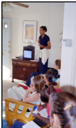
Parenting Class, June 2002

goals. I now know that I will soon go back to school; this quarter's speakers really helped me to learn more about the resources available to me and gave me confidence in pursuing my dreams.