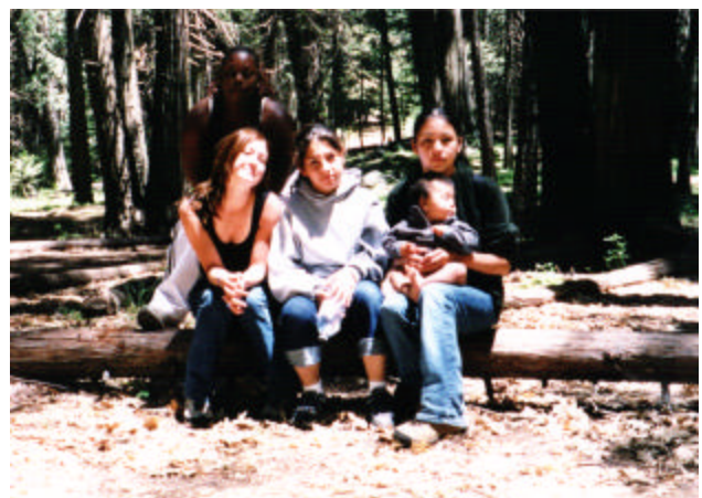
New Creation Home residents at Yosemite

It was then when the boat I was in hit a stick and down it went! Of course, I was the lucky one who got to fall into the melted snow water!