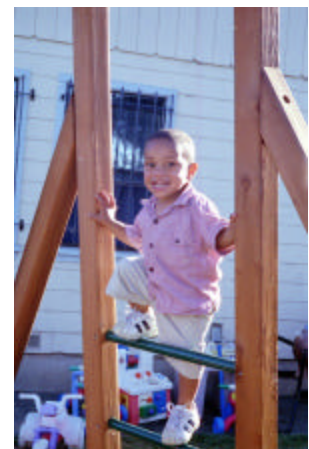
An NCH resident gymnast